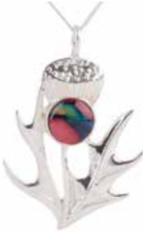
#1116 Heathergem Thistle Pendant..... $74 18" Sterling chain Sterling silver and Heathergem Shown full size, Made in Scotland

Heathergem and 18" Sterling silver chain Shown full size, Made in Scotland