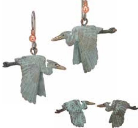
#KBE-13-FH Heron in Flight Earrings.....$72