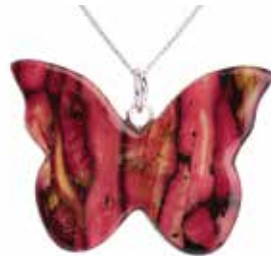
#1102 Heathergem Butterfly Pendant. $45 Heathergem and 18" Sterling silver chain Shown full size, Made in Scotland