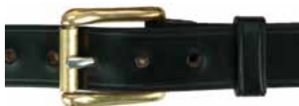
#801 Buckle Shown Half Size Made in USA

Brass Buckles These brass harness buckles with stainless steel tongues and brass rollers have been chosen to reflect the strength of our bridle leather belts. Made in USA.