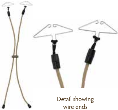
Detail showing wire ends

Breakaway Chin Strap This clever Chin Strap by Akubra is designed to break away if your hat is snagged while riding. The plastic releases pull apart with any excessive tension. It's also convenient for times when you don't need your chin strap. Simply loop the chin strap over the back brim of the hat or remove the longer ends and tuck them into your pocket. The length is 17 inches. A metal guide with the Akubra logo holds the two cords together. The cord is made of nylon. The Breakaway Chin strap is suitable for all Akubra hats we offer, but is not suitable for most hats with cloth sweatbands such as our Panamas. Instructions are included with the chin strap. Designed in Australia, made in China.