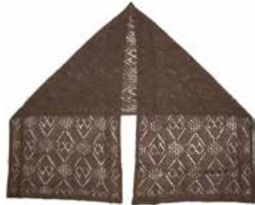
#2105 Qiviut Stole ..... $450