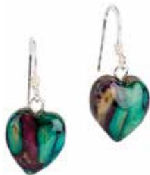
#1097 Heart Earrings, Post.....$42 #1098 Heart Earrings, Fishhook.....$43 Sterling silver and Heathergem Shown full size, Made in Scotland