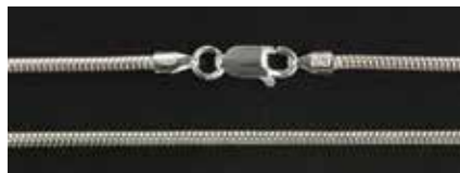
1.9 mm Diameter Chain

Sterling Silver Snake Chains These sterling silver snake chains are the most substantial chains we offer. The smooth, unseamed snake chains are crafted in Italy and will sit comfortably on your neck. The chains have lobster clasps. Sterling silver. Made in Italy.