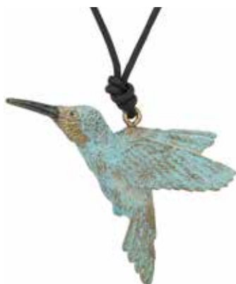
#KB-65-PIN Hummingbird Pin.....$74