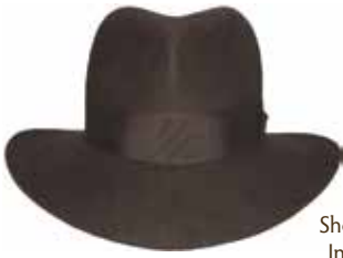
Shown with Indy bash