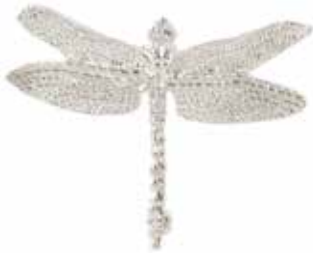
#KS-354-PIN Dragonfly Pin.....$130 #KS-354-PEND Dragonfly Pendant.....$110 Sterling Silver Adjustable Fabric Cord