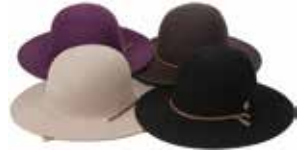
Clockwise from top: Plum, Brown, Black, Putty

Bird and Feather Wool Felt Hat This wool felt hat adjusts to fit hat sizes 6¾ through 7¼. The hat is crushable, so you can put it in your luggage for your next trip. Pop the top and look sharp! The welted brim is ¾ inches and the crown is 4½ inches. A metal feather adorns the leather strap that runs through the brim and around the crown, providing a simple chin strap. The chin strap can be tucked inside the crown when not needed. A metal bird with the Conner logo is attached to the crown. The satin sweatband adjusts for a custom fit. Unlined. Water repellent. UPF rating 50+. Colors are Black, Brown, Plum or Putty. 100% Australian cruelty-free wool. Handmade in China by Conner Hats.