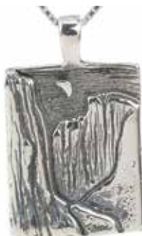
El Capitan and Half Dome #3950 Pendant.....$115