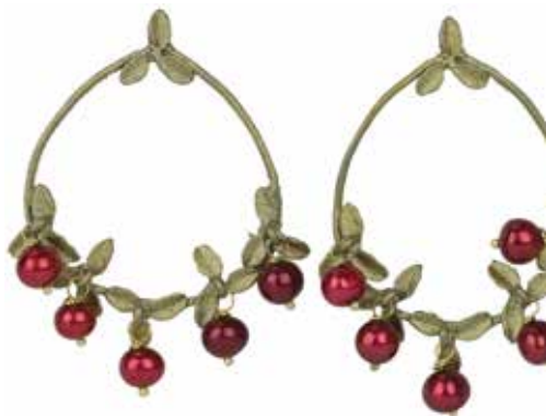
#378E Cranberry Hoop Earrings .....$96 Bronze with Freshwater Pearls (dyed), Sterling Silver Posts