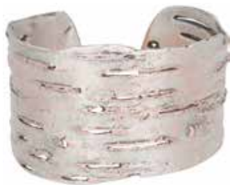
#380B Birch Cuff Bracelet .....$155 Bronze 1 1/2" Width 6 1/4" Devolved length, 3/4" Gap Shown 3/4 size