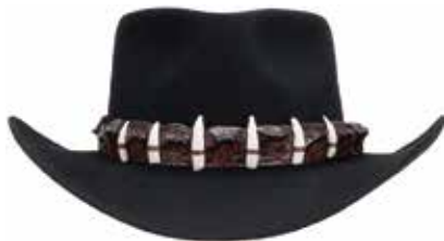
#897 shown on the #1611 Snowy River