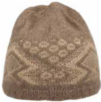
#2107 Qiviut Cloche ..... $165