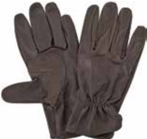
#519 Roper Glove (Chocolate)

Kangaroo Leather Gloves Kangaroo leather is strong, dense, wears well and does not stiffen after being wet. It is available as a very thin leather, which will protect the skin with minimal loss of touch. Kangaroo has over three times the abrasion resistance and the tear strength of deerskin. These gloves are made of a thin kangaroo, supple and long wearing and are suggested for when you want the finest in supple driving, riding or work gloves. We offer the kangaroo gloves in two patterns: a slip-on driving or semi-dress glove and a roper glove with elastic back and palm patch. Unlined. Colors are Gold, Black or Chocolate. Made in USA.