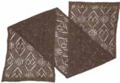
#2102 Qiviut Scarf ..... $300

Qiviut Care Unlike most wools, qiviut is not scratchy and will not shrink in any temperature of water. Hand wash in any mild detergent and dry flat for years of use and enjoyment.