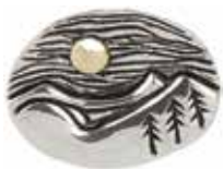
#3516P Sisters Sunrise Pin.....$145

Sterling silver with 18 kt gold sun inlay