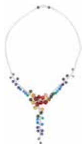
The Aurora Necklace closes with a lobster claw clasp.