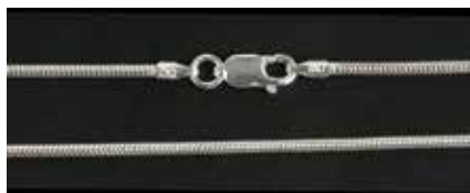
1.5 mm Diameter Chain