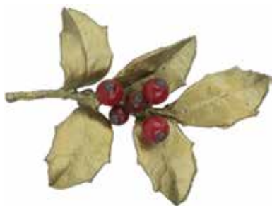
#621P Holly Pin .....$100 Bronze with Red Jade Berries