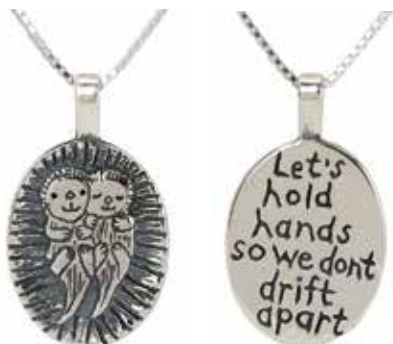
#3504 Otter Pendant.....$90