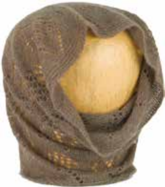
#2101 Qiviut Smoke Ring (Nachaq).....$215

Qiviut – The Wonder-Wool from the Arctic Qiviut (pronounced "kiv-ee-ute") is the warm, soft under-fur of the musk ox, the warmest, softest wool known. The qiviut we offer here is handknitted into scarves and caps by the Eskimo women of the Oomingmak Musk Ox Producers' Co-operative in Alaska. Supply of these marvelous goods became a possibility only when John Teal in 1964 started the Musk Ox Project to bring together re-establishment of the musk ox in Alaska and relief from abject poverty for the Eskimo in the outlying coastal villages. A domestic herd of musk oxen was established, from which the qiviut could be combed each spring for spinning into yarn. Today knitting qiviut is a culture-friendly source of cash income for the coastal villagers, supplying a unique product from a growing arctic resource. We at David Morgan are pleased to be selected as the first of the mail order companies in the lower forty-eight states to be able to offer this outstanding product.