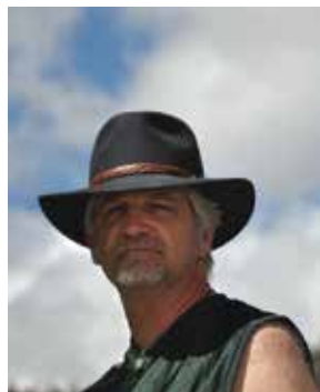
Banjo Paterson in Graphite Gray

AUTHENTIC The felt in these hats is made from a select blend of specially graded furs of rabbit and hare which permits a longer and more arduous shrinking process. This process develops 25% more shrinkage, producing a denser and stronger felt, which in turn provides the basis for a superb pounced finish. The roan leather for the sweatbands is tanned from select sheepskins, for an exceptional quality. The bands themselves are cut wider than normal to ensure the greatest comfort. The Heritage Collection hats are in all ways premium hats in the Akubra tradition, superb long lasting felt with outstanding leather sweatbands.