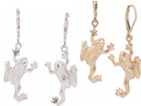
Tree Frog #KSE-6-LB Sterling Silver Earrings.....$74 #KGE-6-LB 14 kt. Gold Earrings.....$760