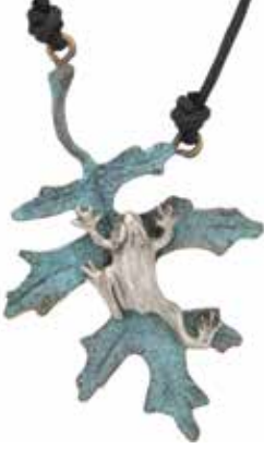
Oak Leaf with Silver Frog

#KB-327-PIN Pin ..... $94 #KB-327-PEND Pendant ..... $94