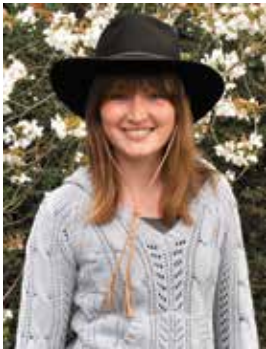
Stampede String shown on #1613 Cattleman by Akubra