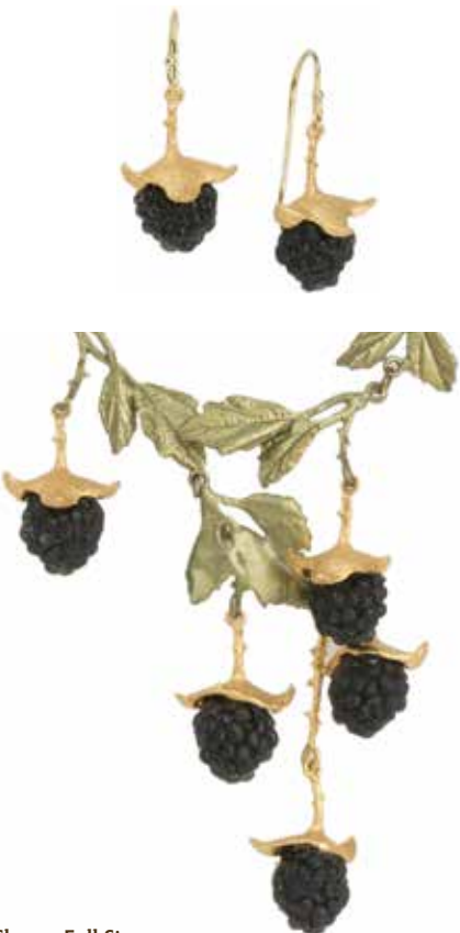
Shown Full Size Hand Crafted in USA