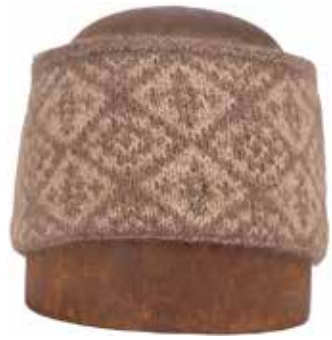
#2104 Qiviut Headband ..... $150

Fits head sizes up to about 7 1/8 comfortably.