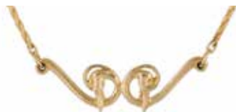
#3373g Heron Necklace, 14 kt. Gold.....$800 19.5 inch necklace length Shown full size, made in USA

Creyr — the Heron was the creator of life among the Celts. Creyr brought the babies, much as the stork among the Teutonic peoples. Renditions of the Heron are common in Celtic art, ranging from simple terminal figures to complex intertwined knotwork.