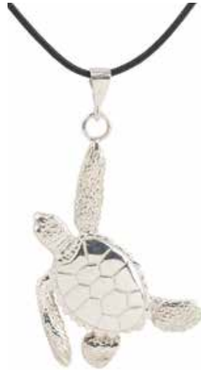
#KS-90-PIN Sea Turtle Pin.....$160 #KS-90-PEND Sea Turtle Pendant.....$140 Sterling Silver Adjustable Fabric Cord

Wildlife in Silver and Gold Some of Cavin's designs are available in sterling silver and 14 kt. gold. The fine details of Cavin Richie's carving are apparent in these lost wax castings. Made in USA.