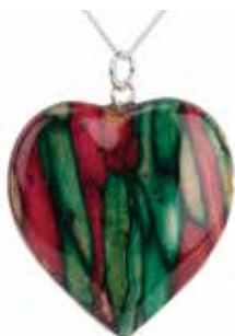
#1107 Heathergem Heart Pendant.....$52 18" Sterling chain Sterling silver and Heathergem Shown full size, Made in Scotland