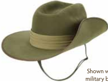
Shown with military bash

Open Crown Hats Back when hat stores were common most hats were sold with open crowns. The crease, or bash, would be put in for the customer by the salesman at the time of purchase. These days, hat stores are hard to find and almost all hats sold have pre-creased crowns. For those of you who still want an individualized bash, we offer a number of open crown hats from Akubra. Shape the crown to suit you best, then, when the hat is damp from the rain, make any final adjustments and let the hat dry. We include instructions with each hat or check online at davidmorgan.com for more information and instructional videos.