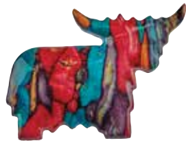
Heathergem #1096 Highland Coo Brooch..... $39

Heathergem brooch with silver plate clasp Shown full size, Made in Scotland