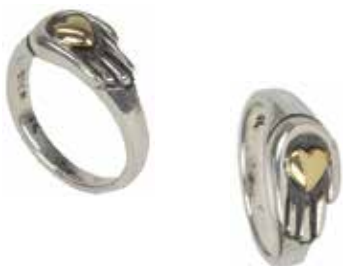
#3918 I Give You My Heart Ring.....$130