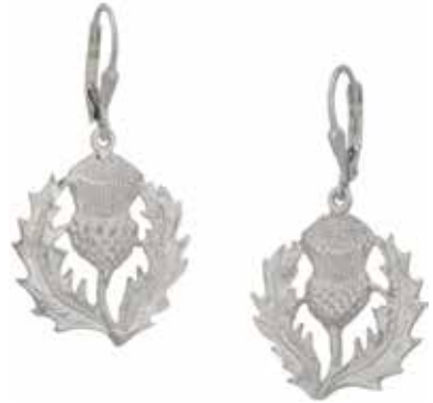
#3218E Thistle Earrings..... $66 Sterling silver, made in USA Shown full size