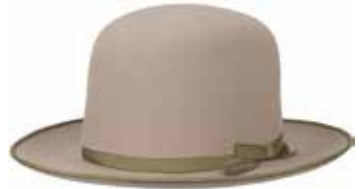
Shown with open crown

Made by Akubra for the Australian Army since the early 1900's, the Aussie Slouch is the authentic full-quality military hat.