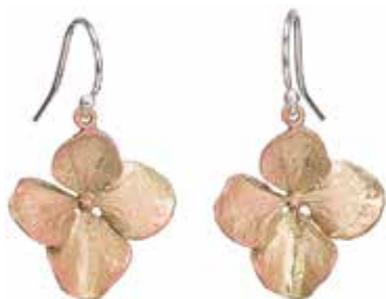
#373E Hydrangea Earrings .....$75 Bronze Sterling Silver Fishhooks

Shown Full Size (Bracelets 3/4 Size) Hand Crafted in USA