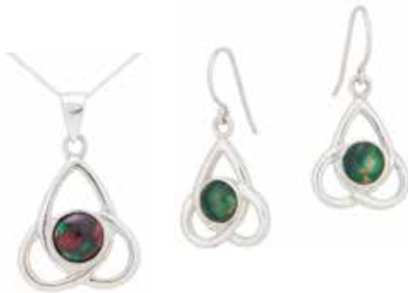
#1117 Heathergem Triskele Pendant...$52 18" Sterling chain #1123 Heathergem Triskele Earrings...$58 Sterling silver and Heathergem Shown full size, Made in Scotland