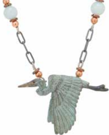
#KB-9-2BN Heron Necklace.....$145