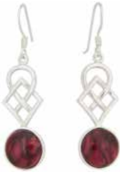
#1124 Earrings with Knotwork..... $56 Sterling silver and Heathergem Shown full size, Made in Scotland