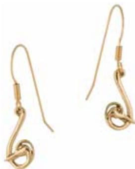
#3372g Heron Earrings, 14 kt. Gold.....$270 Shown full size, made in USA