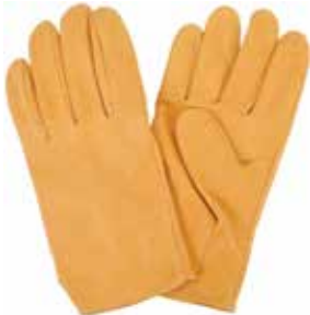
#510 Driving Glove (Gold)