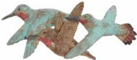
Shown Full Size Made in USA

Hummingbirds This delightful trio of Rufous Hummingbirds is available as a pendant or pin, and pairs well with our Mirrored Rufous Hummingbird Earrings. The pendant, pin and earrings are bronze. The earring post and clutch back are sterling silver. Made in USA.