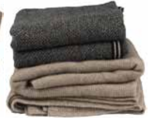
#L9998 (top) #L9994 (bottom)