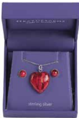
Heart Pendant, Round Stud Earrings #1126 Heathergem Heart Set.....$64 18" Sterling chain, Stud Earrings Sterling silver and Heathergem Shown half size, Made in Scotland

Please visit davidmorgan.com to learn more about the unique process by which Heathergems are created. The jewelry is sent to you gift boxed, with a card explaining the origin of Heathergems.