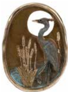
#KB-173-PIN Heron in Cattails Pin.....$74