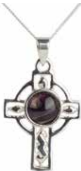
#1108 Heathergem Celtic Cross..... $44 18" Sterling chain Sterling silver and Heathergem Shown full size, Made in Scotland