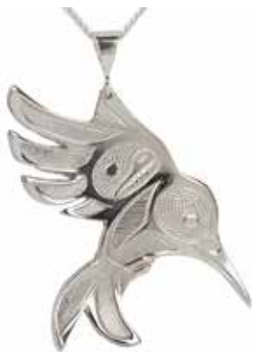
Shown Full Size Made in Canada