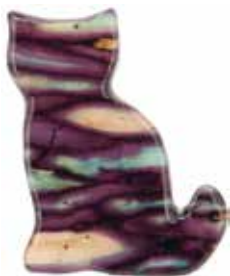
#1118 Heathergem Cat Pin.....$36 Heathergem with silver plate clasp Shown full size, Made in Scotland