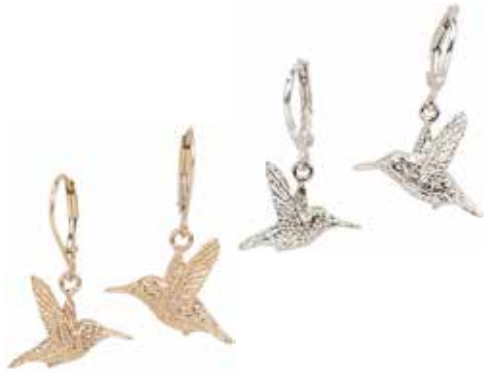
Mirrored Rufous Hummingbirds #KSE-52-LB Sterling Silver Earrings.....$74 #KGE-52-LB 14 kt. Gold Earrings.....$350