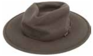
Regency Fawn Shown crushed, ready for packing.