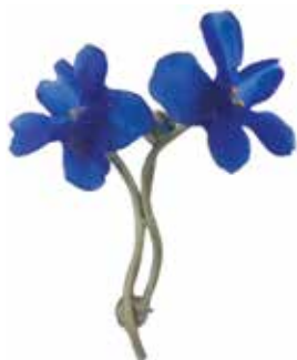
#220P Wild Violet Pin .....$75 Bronze with hand-formed glass flowers

Shown Full Size (Bracelets 3/4 Size) Hand Crafted in USA