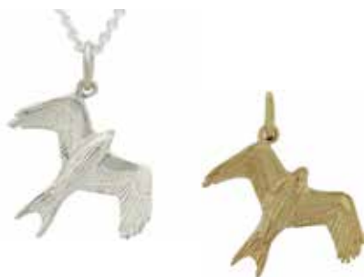
#3278g Barcud (Red Kite) Pendant.....$340 14 kt. gold, chain not included #3278 Barcud (Red Kite) Pendant.....$60 Sterling silver, 18" sterling chain Made in USA, Shown full size

Creyr — the Heron was the creator of life among the Celts. Creyr brought the babies, much as the stork among the Teutonic peoples. Renditions of the Heron are common in Celtic art, ranging from simple terminal figures to complex intertwined knotwork.