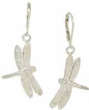
Dragonfly #KSE-89-LB Sterling Silver Earrings.....$110

Wildlife in Silver and Gold Some of Cavin's designs are available in sterling silver and 14 kt. gold. The fine details of Cavin Richie's carving are apparent in these lost wax castings. Made in USA.