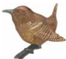
#KB-69-PIN Winter Wren Pin.....$68