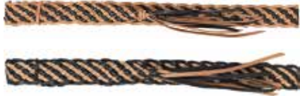
#835 Two Tone Hat Band ..... $68 Please state edge color — Natural Tan or Black Hand braided kangaroo leather, made in USA