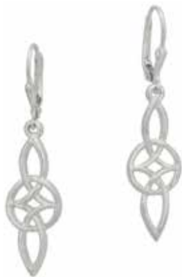
#3385E Earrings, Sterling silver.....$60 3385Eg Earrings, 14 kt. gold.....$740

Everlasting Love — Serch Bythol Among the Celts, the triskele is used to represent the tripartite nature of life and people. In this jewelry two triskeles are linked together to form the circle of eternity, denoting two people, in body, mind and spirit, joined together in everlasting love.