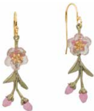
#401E Peach Blossom Earrings .....$105 Bronze with Hand-formed Glass Flowers Gold Filled Fishhooks