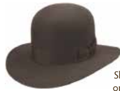
Shown with open crown

Measure Hat Size Twice! — Avoid Exchanges