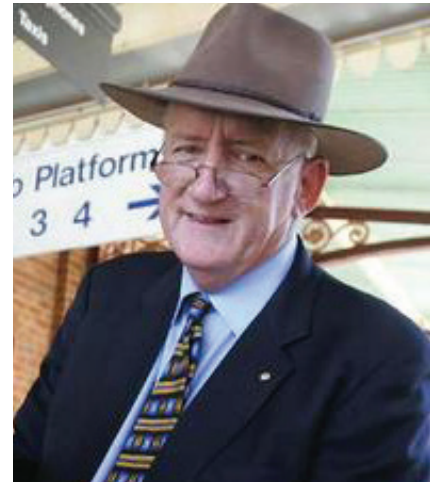
Mr Fischer in his famed Akubra

Akubra pays tribute to former Nationals leader and Deputy Prime Minister Tim Fischer, who passed away in August at age 73.