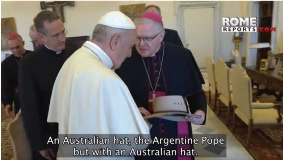
An Australian hat, the Argentine Pope but with an Australian hat.

Pope Francis received an Akubra hat in June this year, gifted by 38 visiting Australian bishops. Watch the video here